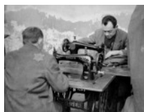
HOLOCAUST SURVIVORS IN STANDOFF WITH GERMAN GOVERNMENT OVER REPARATIONS