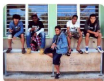
A FRENCH SLICE OF SOUTH PACIFIC, NEW CALEDONIA FACES UNCERTAIN FUTURE